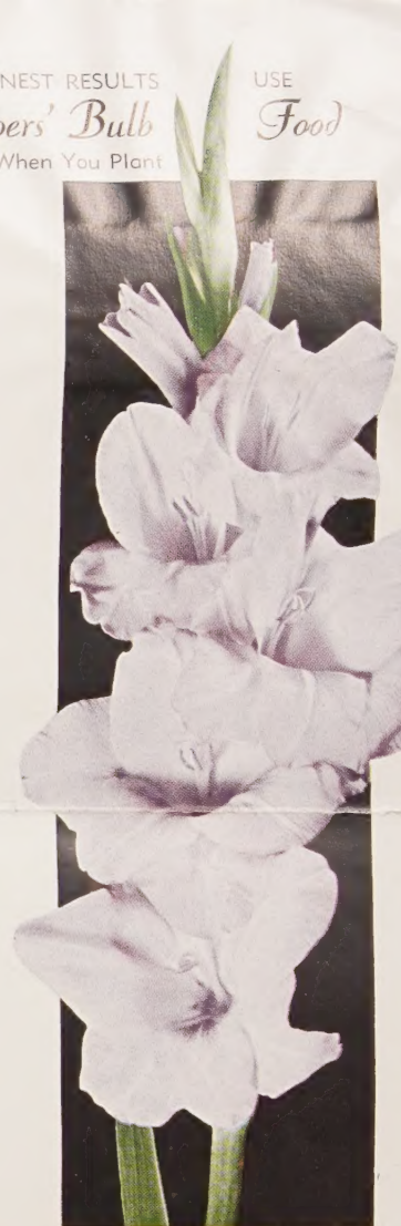
AVE MARIA $1.35 for 10 $11.00 per 100

25 Corms or more of 1 variety sold at the 100 rate.